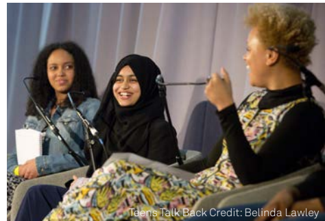
Teens Talk Back

Featuring contributions from local girls and our festival WOWsers.