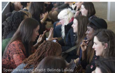
Speed Mentoring